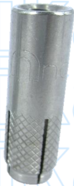
Stainless Steel 304/316